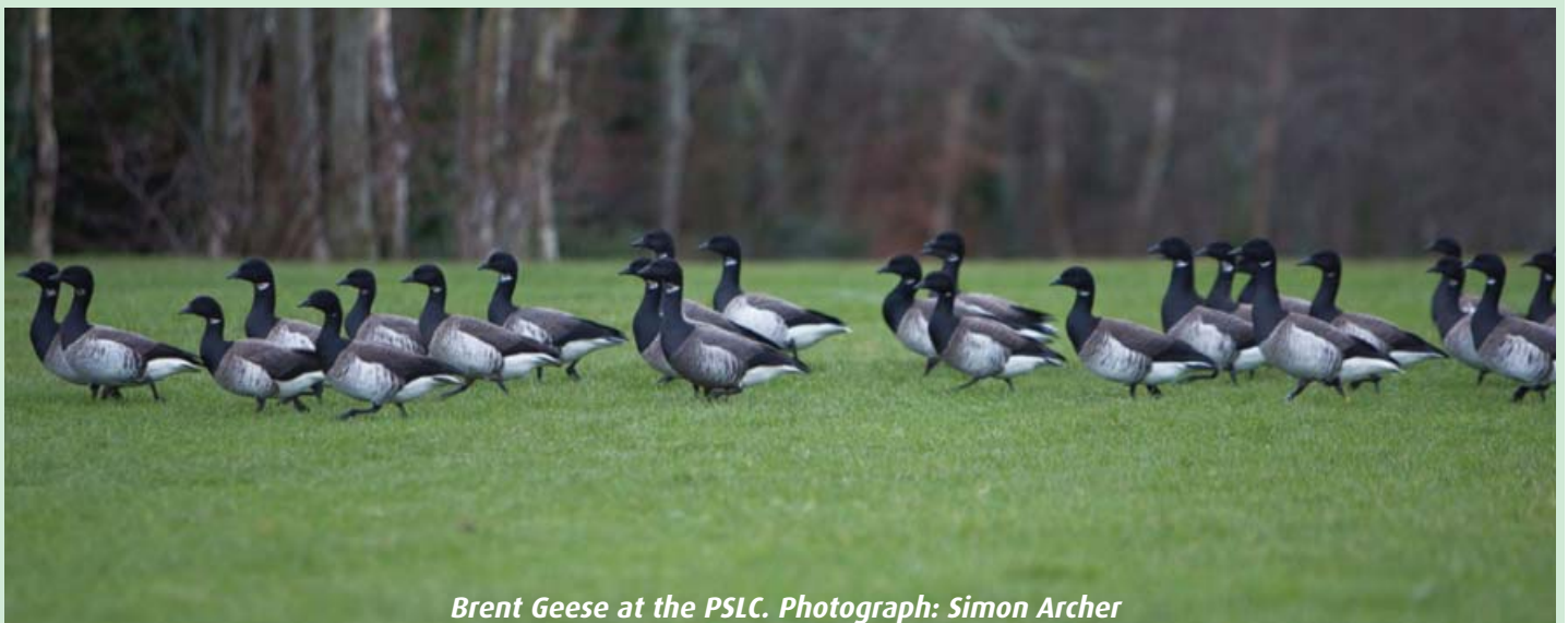
Brent Geese at the PSLC.

Contacting the PCA: If you wish to contact the PCA on any issues in our community or volunteer for any of our committees why not call us 087 248 6287 (leave a message) or email portmarnock1@gmail.com . You can visit our website/Facebook at www.portmarnock.org